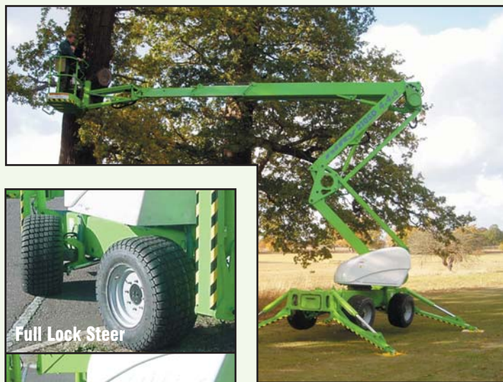
Full Lock Steer